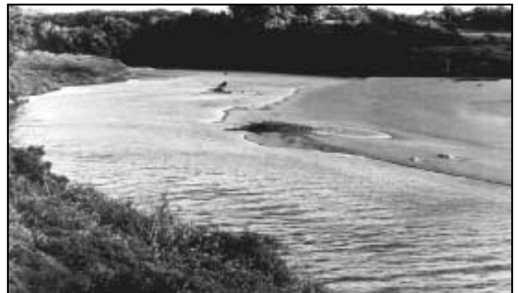
Gualala River: "Mouth of the Gualala River, Mendocino County."

Contaminants in drinking water, notably heavy metals and pesticides, can compromise human well-being and the species that depend on good-quality water for their survival and reproduction. Preserving clean, fresh water is thus a major challenge in our local communities and throughout the nation. A key to protecting surface and ground water is reducing the introduction of pesticides into otherwise clean waters.