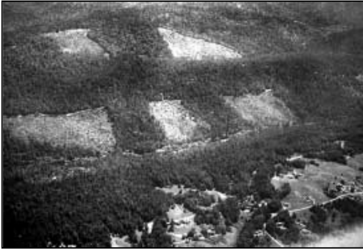
Forestry Cutting: “Clear cuts behind the Sea Ranch, CA.”

Action” case) where two major companies contaminated drinking water, sparked more systematic policies and regulations to protect water quality.